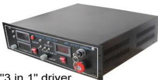
"3 in 1" driver