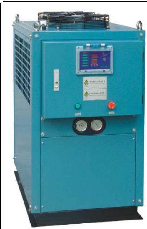
ST-WE115 and ST-WE148